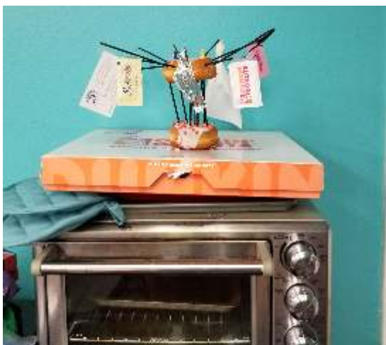
Como Third Shift Art